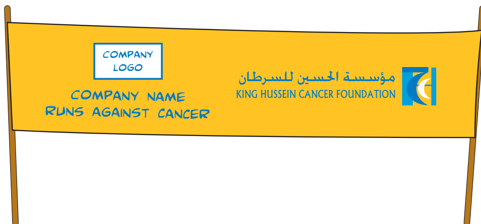
TEAM BANNER DESIGN DIMENSIONS 1M X 5M

Kindly note: Participating companies must abide by design guidelines presented by KHCF and must not use the event to market any commercial products.